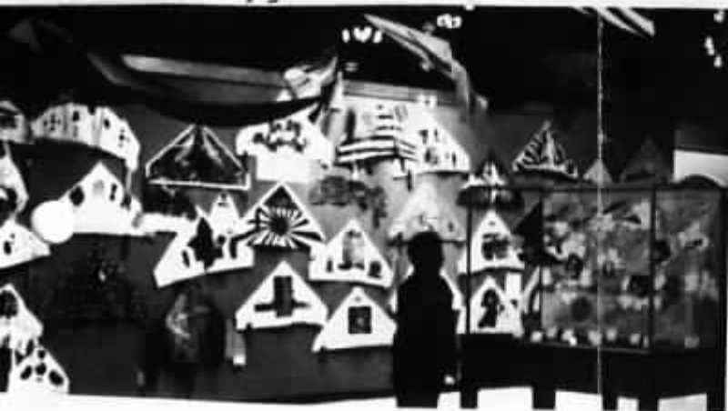
An observer stands in front of the miniature kite display, with the children's kites displayed in the background and WKA member's kites overhead.