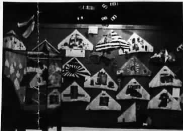
The Oriental miniature kites display with the children's kites in the background and Harold Writer's miniature box kite mobile, top center, at the Pacific Science Center.