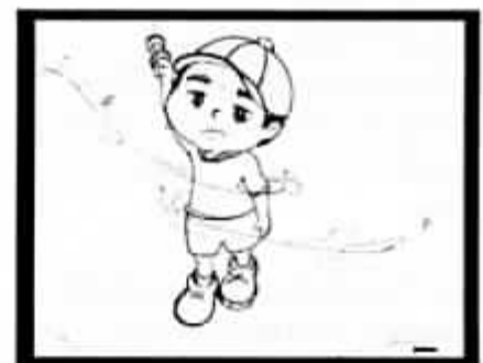
Timmy's kite flying him