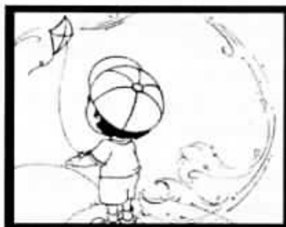
Timmy's flying a kite