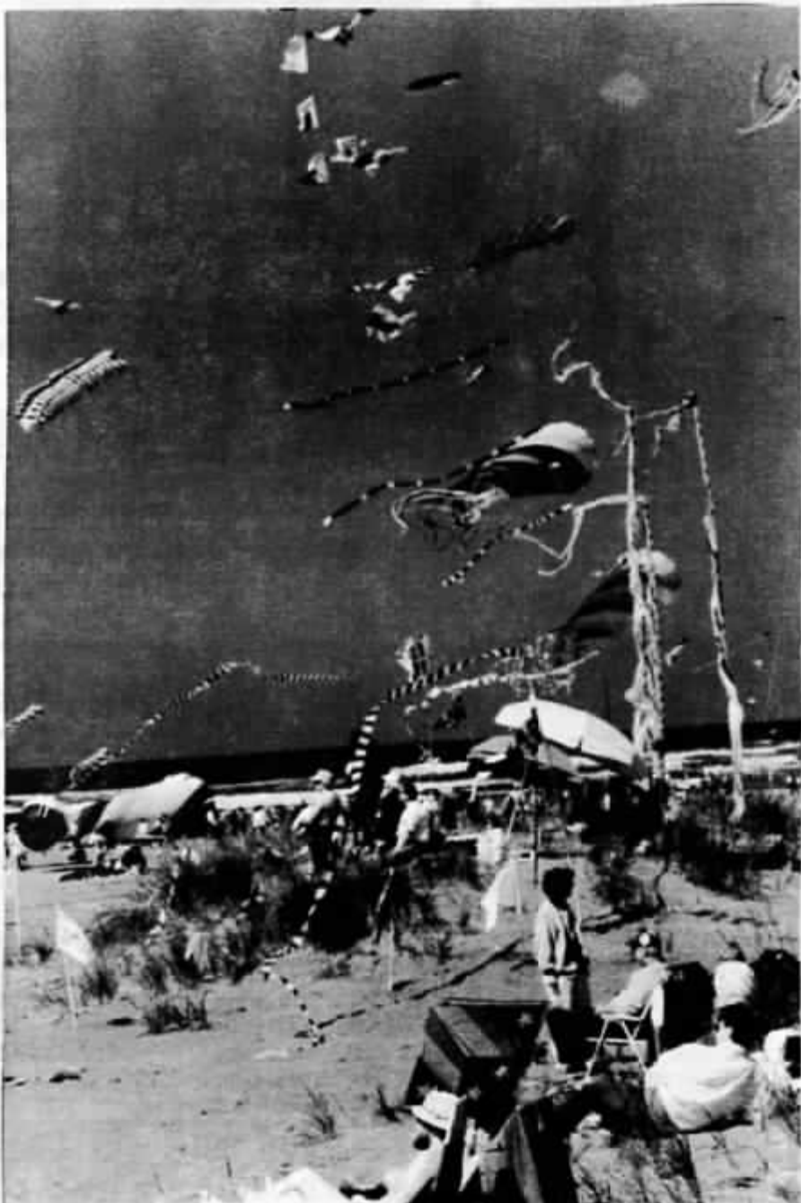
The 7th Annual WSIKF at Long Beach as seen from the WKA knoll.