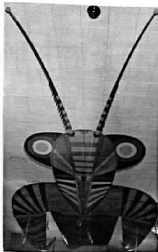
One of George Peters' spectacular creations on display at the 1991 Fort Worden Kitemakers Conference.

That's our un-rigid plan for four great days of fun that we hope will send you home happy. *