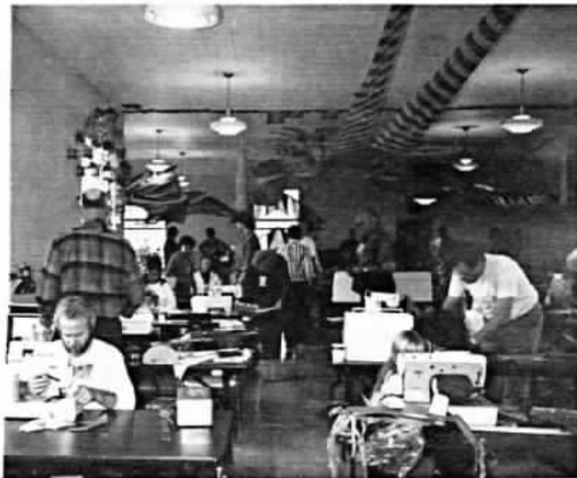
Kitemakers hard at work in the sewing room.