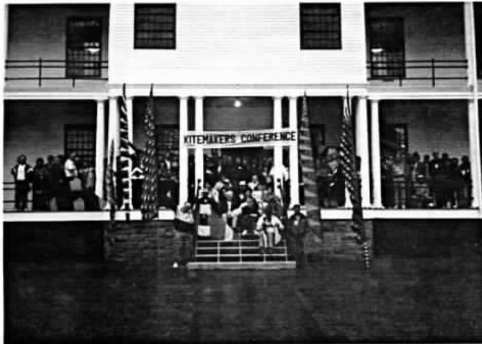
Everyone gathers for the traditional Fort Worden group photo.