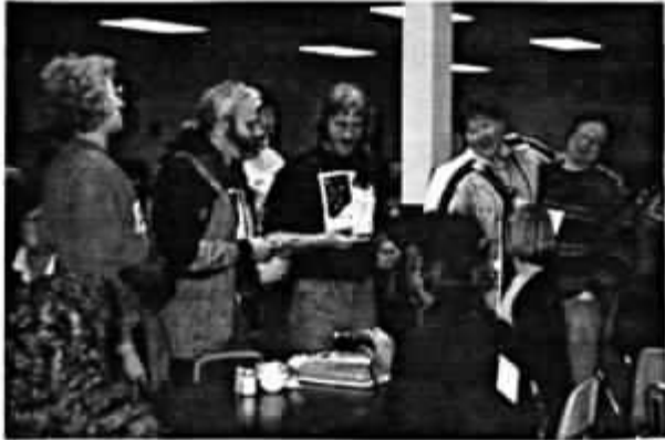
Birthday Celebration held at Sunday's lunch.