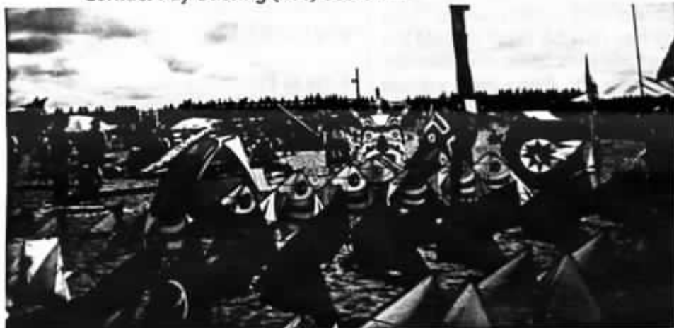
Typical beach scene at Long Beach during 1991 Washington State International Kite Festival.