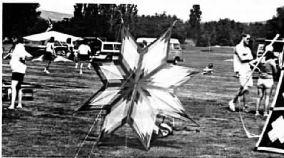
Kiters having "Fun in the Yakima Sun" during the Second Annual Yakima Valley Festival.