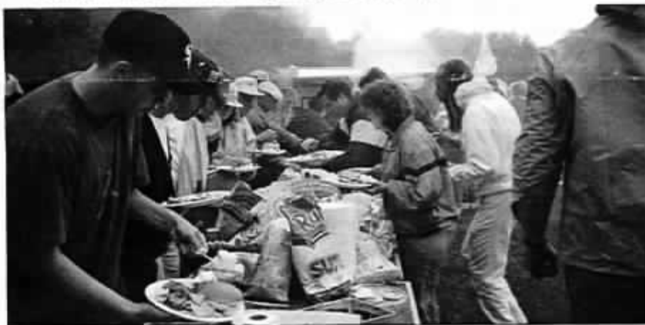
Hungry festival attendees at Yakima load up their plates with goodies, pot luck style, after first getting their barbecued hamburger provided by Yakima Valley Kitefliers at the head of the line.