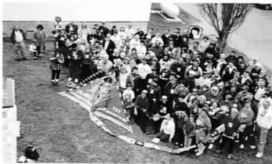
1993 Fort Worden attendees gather for the traditional group photograph.