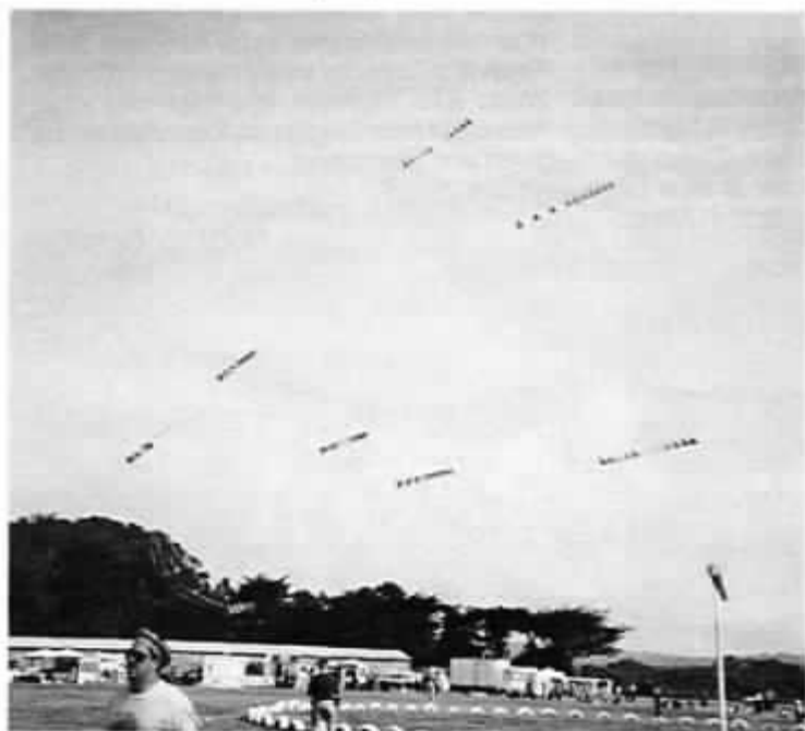
The Sundowners and Team Paragon getting together for a mega-fly at the Redwood Coast Kite Festival.