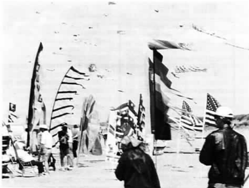
A view of some of the "camp sites" on the beach at last year's Westport Festival, showing the good winds and beautiful weather we hope to see this year.

Public please vote from 12 noon to 4 pm at the Registration Booth.