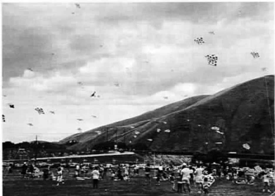
Part of the flying field at the Yakima Valley Kite and Flight Festival, showing some of the hundreds of Tree Top kites that were given away to children (and to some "big kids" too).

Any items relating to kites or kitefliers, 10 cents a word ($3 minimum) per issue. Lost, found, free or stolen items listed free of charge. If under 30 words. Make check payable to the WKA and send to Judy Millspaugh, Editor, 7573 Old Redmond Road, #5, Redmond, WA 98052.