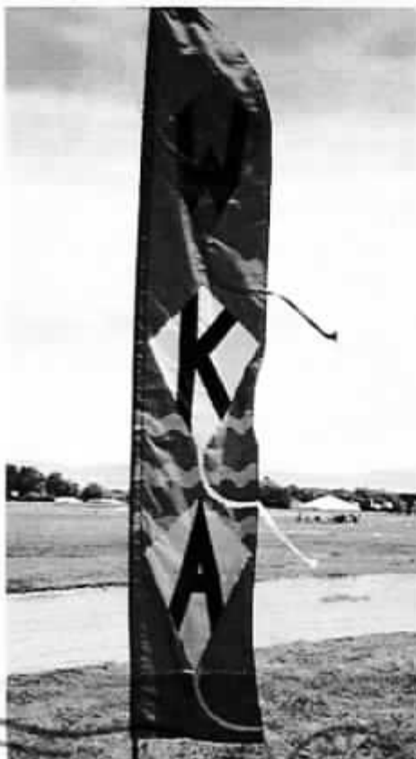
WKA Banner—purple background, black letters; kite backgrounds: W-red, K-yellow, A-blue; green waves.

Kits (by Carla Fox) containing pre-cut material and instructions to sew a 12' WKA banner, $42 each. Make checks payable to the WKA. Contact Susie Christenson, 3594 East E, Tacoma, WA 98404, (206) 471-9103.