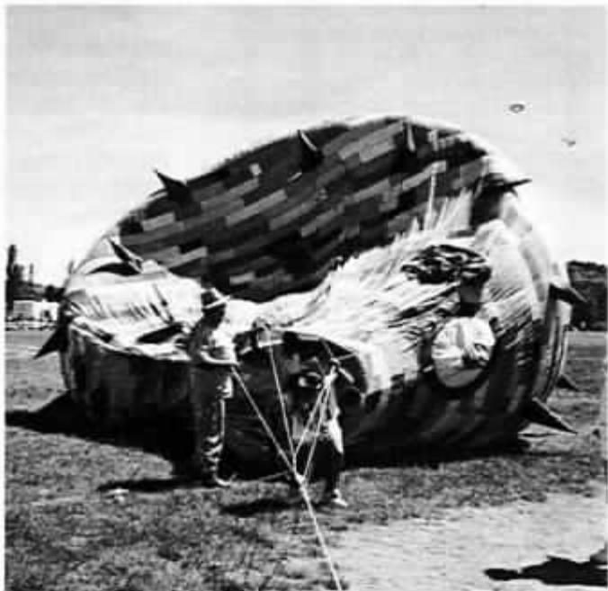
Tom Sisson, letting kids out of the partially-deflated Puffer Fish at Demo Day (fully inflated while kids move around in it).

After the hard work was all done, Safeway provided the hamburger, beans and all the other goodies that make barbecues so much fun. What a fantastic job, Gasworks!! You folks worked hard on your day off, and we thank you!