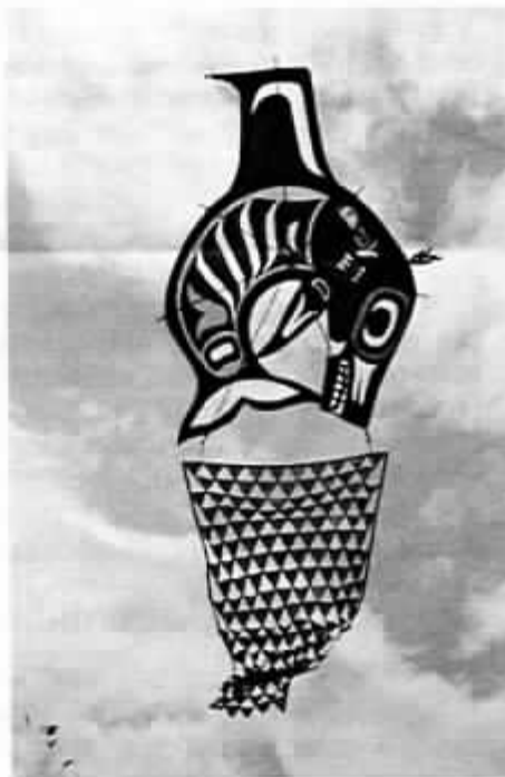
Don Mock's latest creation, Orca , which won top honors at both Yakima and Westport.

Due to the high winds and on-and-off misty conditions the Friday evening Picnic on The Beach was looking like it should be moved to an indoor location. However, kitefliers in the Pacific Northwest are hardy individuals and used to such conditions, so Jim McSparran and Bill Stitts and their helpers set up the barbecues, tables, etc., on the beach as planned. The huge turnout proved that a little weather can't stop kite