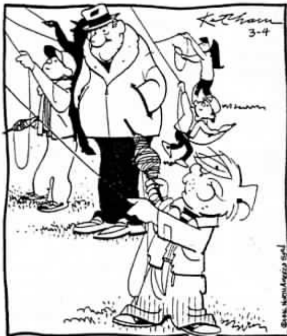
"WOULD YOU HOLD MY KITE, MR. WILSON? I GOTTA GO TO LUNCH."