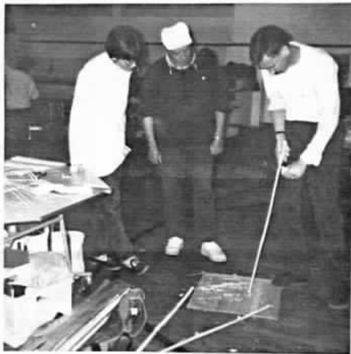
Top & Bottom: Class members painting the sand swallow.