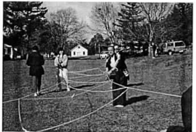
The finished pattern up off the ground!