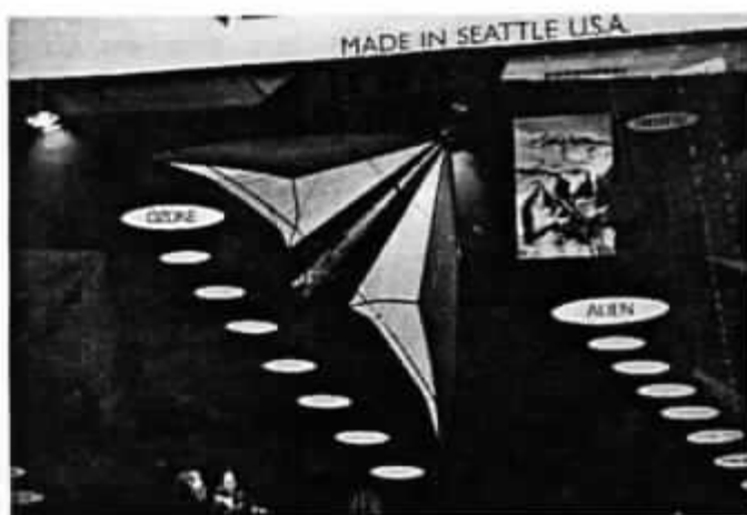
Prism Ozone, KTA display