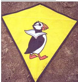
Kite by Ellen Pardee

More of the kites from the Lady Kiteflyers kite arch