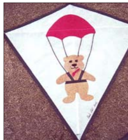
Kite by Barb Hall