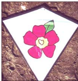
Kite by Bev Dockrill