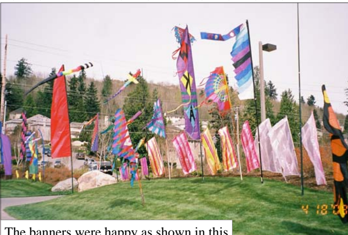
The banners were happy