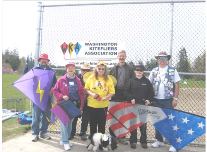
The WKA gang at the Bellevue Earth Day/Arbor Day festival