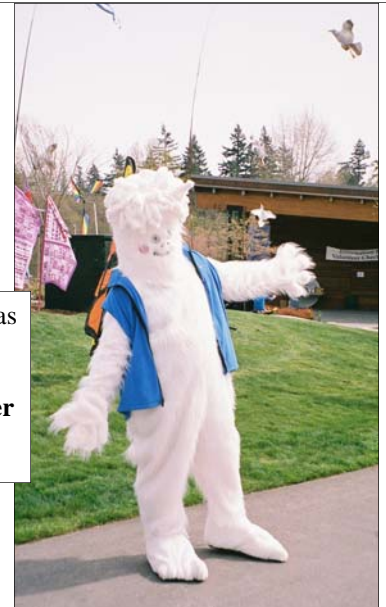
This character is known as “ Carbon Footprint ”