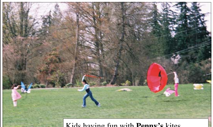
Kids having fun with Penny's kites.