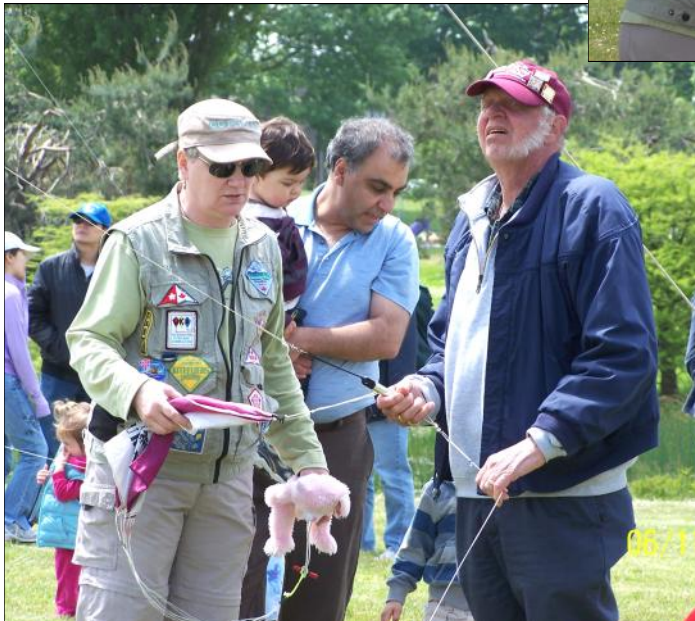
Setting it up while a parent and child are patiently waiting. Kids really love the Teddy Bear drop and getting to take the flyer home too!! And the bear is flying safely too. No bears are harmed in this action.