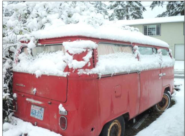
A vehicle from "yesteryear". Snow knows no boundaries.