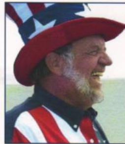
In God We Trust