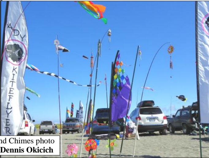
Wind Chimes