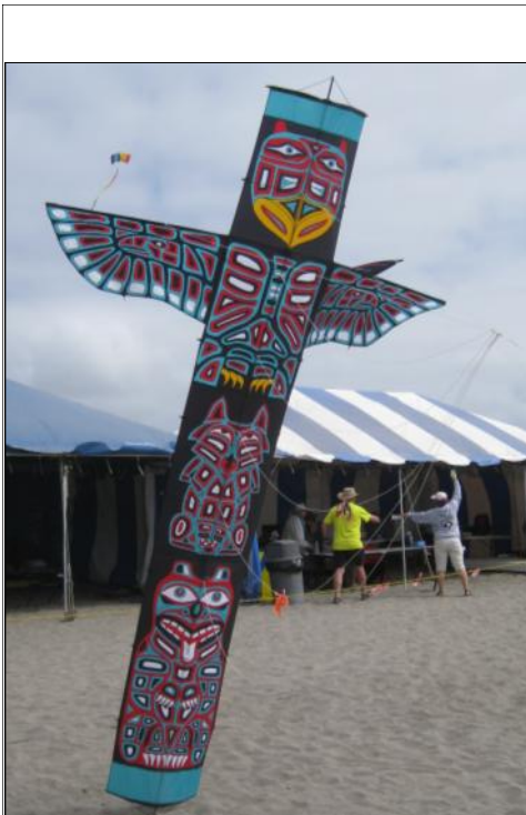
The last page photo

Dave Colbert's totem pole kite. Glad he is sewing and creating again. Well done!