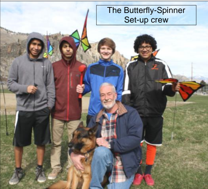
The Butterfly-Spinner Set-up crew

With my high school helpers, I put up a lot of butterfly spinners and other ground displays. (Note to self: make sure the helper crew is around at the end of the day when it’s time